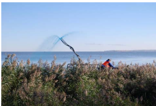
Treating Phragmites with Argo ATV

Bay-Lake RPC, in cooperation with local partners, will host a workshop for landowners interested in invasive Phragmites management.