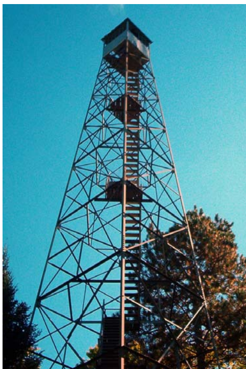
Mountain Fire Lookout Tower (Oconto County)

Gone are the days of spotting fires in Wisconsin using fire towers. Today, fires are more often identified using aerial surveillance and spotters on the ground with cell phones. The need for fire towers has diminished as the prevalence of cellphones has grown. Another factor is more people living in areas that were once sparsely populated forested areas. Today, more than 90% of forest fires are first reported by citizens according to Trent Marty, Director of DNR's Bureau of Forest Protection. Over the past year, the DNR conducted a broad evaluation of the use of fire lookout towers for fire reporting. As part of the effort, the program assessed the costs to maintain, repair, or replace fire towers utilized throughout the state.