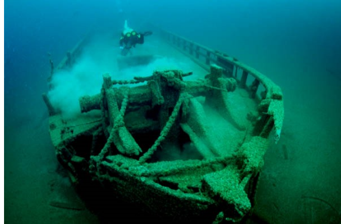
The schooner, Home, is one of the oldest shipwrecks discovered in Wisconsin.

The public can weigh on the proposal for a new NOAA national marine sanctuary in Wisconsin that would protect nationally significant shipwrecks. The sanctuary was originally proposed to NOAA in 2014, and if created would be the first since 2000.