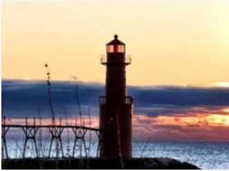
Algoma Lighthouse. City of Algoma. 2013.

Do you have a great photo taken somewhere in northeast Wisconsin? We would love for you to share it with us! We are looking to enhance our website and brochure by showcasing the region as seen through the eyes of those individuals who reside in or visit northeast Wisconsin. The photo can be just about anything (past or present) that represents your community or the places you enjoy visiting in northeast Wisconsin, such as a photo of a community facility or business, farm field, barn, natural feature, Lake Michigan, a baseball game, a county fair - the sky's the limit. Photos must be taken somewhere within the counties of Brown, Door, Florence, Kewaunee, Manitowoc, Marinette, Oconto, or Sheboygan. We will consider all submissions.