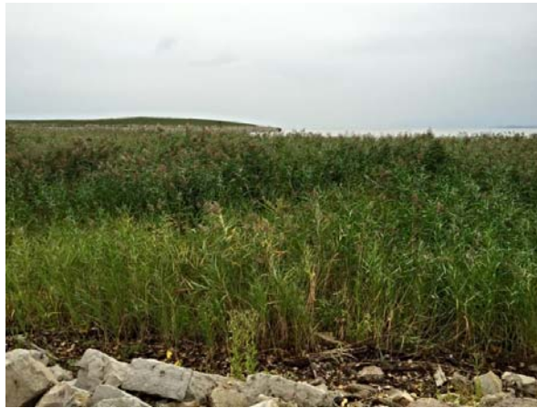
Bay Beach with Renard Island in the background

The Commission will treat a 10-acre demonstration site at Bay Beach this week, and plans to mow the site in the winter. This site will provide information to gauge the effectiveness of the approach, and provide a demonstration site for outreach efforts through the winter.