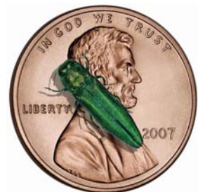
EAB on a penny

We received 43 grant applications. About half of them come from southeastern Wisconsin, with the remainder coming from the Bay-Lake and East Central Wisconsin regions, as well as one from Northwest Wisconsin. A total of $568,370 is being requested (of $82,000 available), with individual funding requests ranging from $2,000 to $20,000. The funding is made available through a FY2015 U.S. Forest Service Great Lakes Restoration Initiative grant received by the Bay-Lake Regional Planning Commission earlier this year.